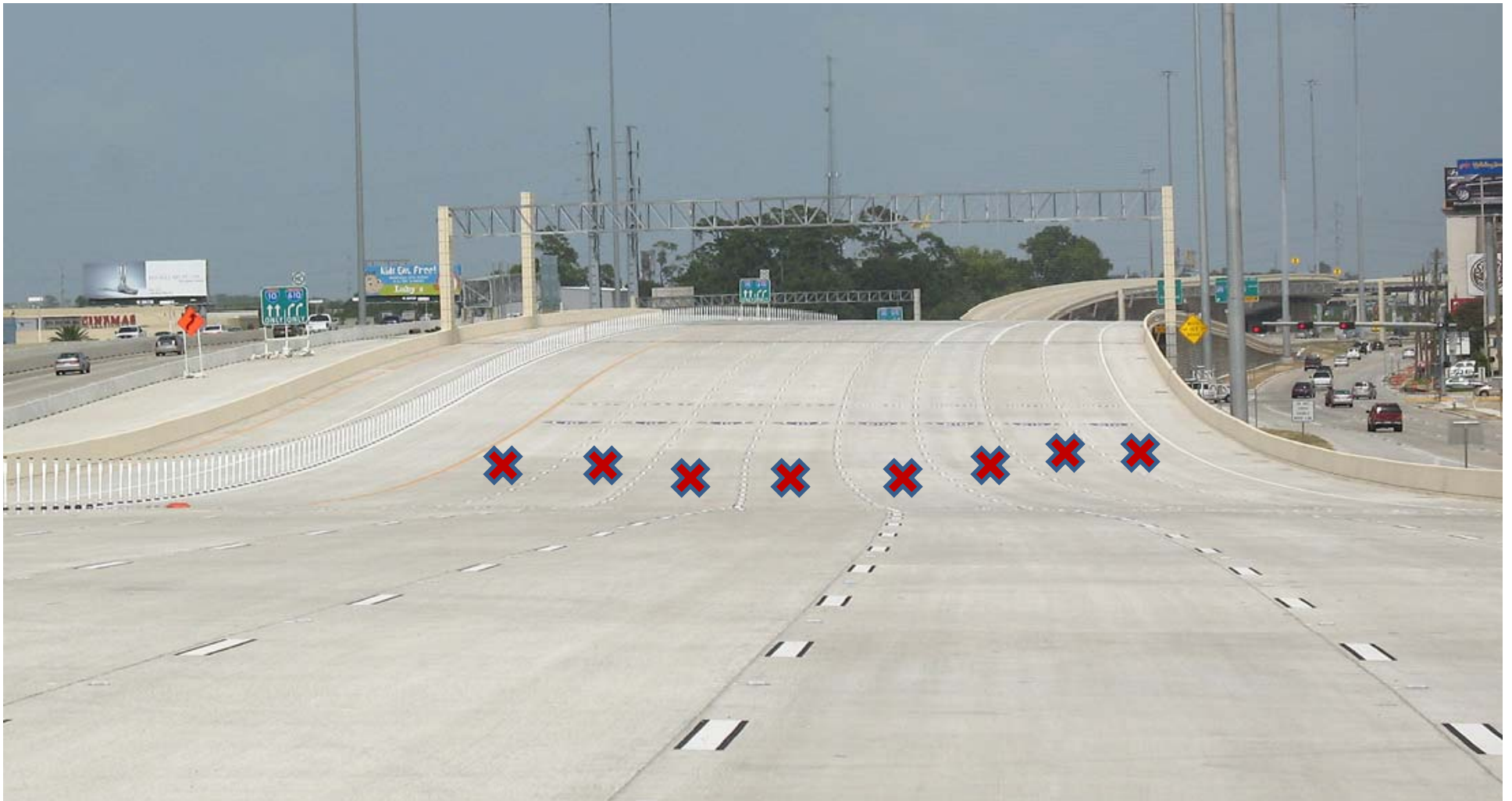
Katy Freeway - there are 8 traffic lanes approaching the 610 interchange http://www.houstonfreeways.com/modern/2008-07-06_katy_freeway.aspx